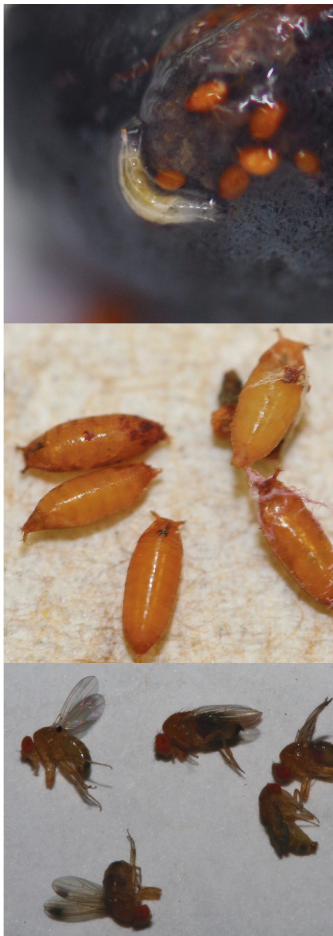
Figure 3. D. suzukii larvae (top), pupae (middle), and adult flies (bottom) (each 2–3 mm) reared from blueberries in Oregon.

Berry growers who use closed canopies and tunnels, as well as those who use shady areas in crop