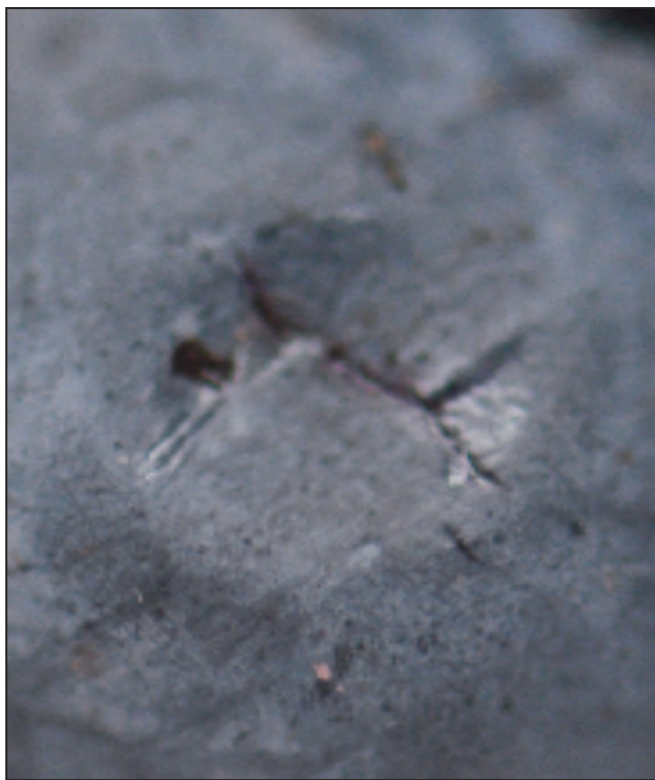
Figure 4. Deterioration of blueberry fruit damaged by D. suzukii around oviposition and feeding site.

Infestation of fruit reveals small scars (speckles) and indented soft spots and bruises on the fruit surface left by the female's ovipositor ("stinger"; figs. 4 and 5). The eggs hatch in a short time, about 1–3 days, and maggots soon begin feeding inside the fruit. Fruit damage is caused by the maggot feeding. In as few as two days, the fruit will begin to collapse around the feeding site. Thereafter, fungal and bacterial infections and secondary pests may contribute to further fruit deterioration. These damage symptoms may result in severe crop losses. The implications for exporting producers may also be severe, depending on quarantine regulations.