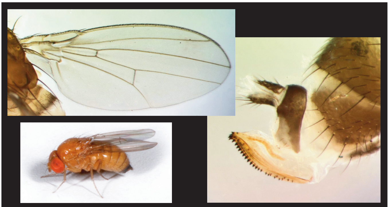
Figure 2. Female D. suzukii fly (2–3 mm). Right shows female genitalia. Top left and right , photos by G. Arakelian, Los Angeles Weights and Measures, reproduced by permission; bottom left , photo by M. Hauser, CDFA, reproduced by permission.