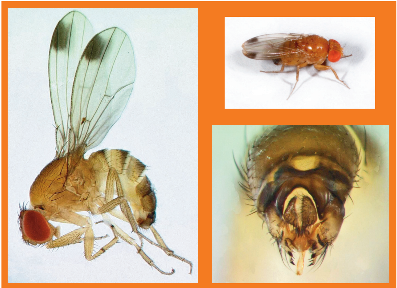
Figure 1. Male D. suzukii fly (2–3 mm). Lower right shows male genitalia. Left and bottom right , photos by G. Arakelian, Los Angeles County Department of Agricultural Commissioner/Weights and Measures, reproduced by permission; top right , photo by M. Hauser, California Department of Food and Agriculture (CDFA), reproduced by permission.